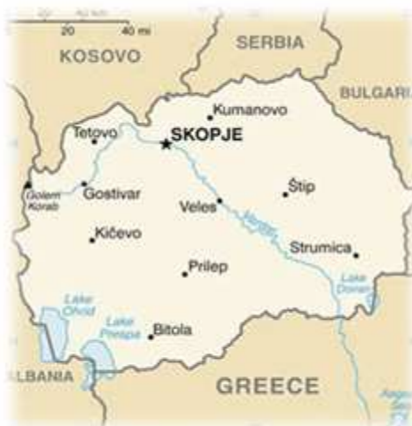
Figure 1: Macedonia Nowadays

Macedonia has an interesting, as well as a complex history. Numerous historical events took place here and several empires ruled over the country. The Macedonian history begins 2,500 years ago with Alexander the Great (real name Alexander III of Macedon) who was one of the key historical figures in his time. He was famous for its battles and enormous empire. At its peak it even reached the region of where nowadays Pakistan is (Worthington, 2004). The empire of Alexander III of Macedon had its home country Macedonia in,