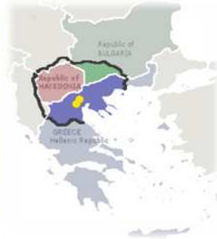
Figure 2: Macedonia 500 Bc

nowadays, Greece and Macedonia (figure 2). After the era of Alexander the Great, Macedonia was part of the Roman Empire. The Roman province Macedonia consisted of great parts of what now is known as Greece. In the years thereafter Macedonia was part of different empires, such as the Bulgarians, the Serbians and the Ottomans. This region was conquered many times; there were many strong empires constantly in this region.